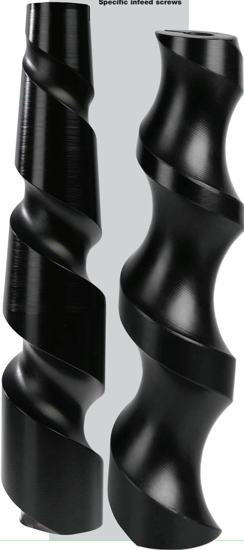
Specific infeed screws

T iama considers customer support as a main priority in its service strategy. This is why a real offer with a full range of services has been developed to be able to help customers with their daily stakes and challenges. The Toolings' activity is fully in line with this strategy.