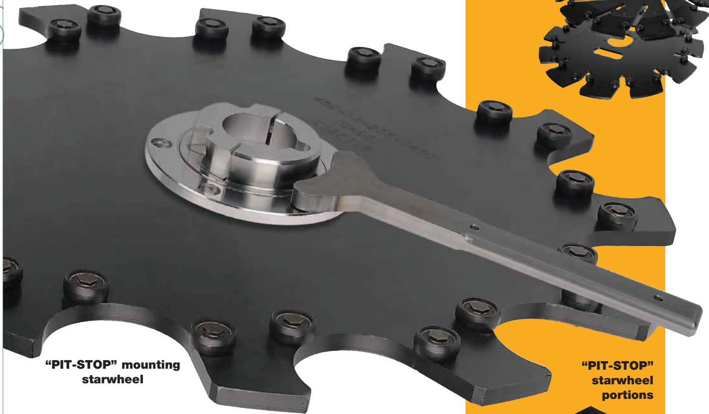
“PIT-STOP” mounting starwheel