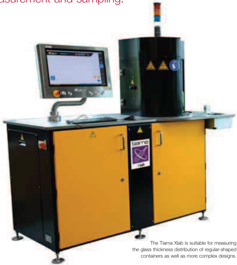
The Tiama Xlab is suitable for measuring the glass thickness distribution of regular-shaped containers as well as more complex designs.

Designed to be production-oriented and user-friendly, Tiama Xlab can be integrated into any existing glass production process, at the hot end, cold end or in a laboratory. Used for hot end process control, the Xlab ensures quality control from the first manufactured containers, making faster process and quality countermeasures and improvements. In a laboratory setting, the Xlab offers standard and advanced quality controls, and the ability to automate multiple operations with one tool.