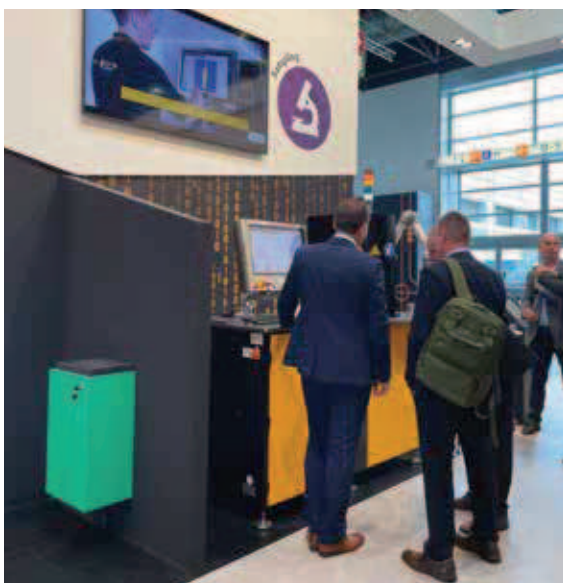
Tiama exhibited the Xlab at glasstec 2022.