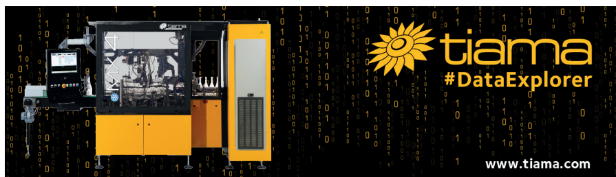
▲ MX4, data provider machine.